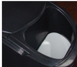
Easy-slide cover design